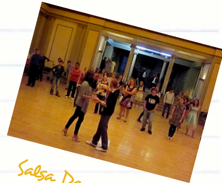
Salsa Dance Lessons

One of our small groups has also been attending a spoken word (poetry/rap) open microphone event with the hopes of reaching more of the black population on campus. There are still so many unreached people groups.